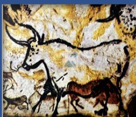
Name: Aurochs Artist: Stone Age Civilisation Date: c. 17000 BCE Location: Lascaux Cave

This term, our topic is Sand vs Stone. We will be learning about life in Stone Age Britain, then contrasting this with finding out about life in Ancient Egypt, including an exciting museum trip!